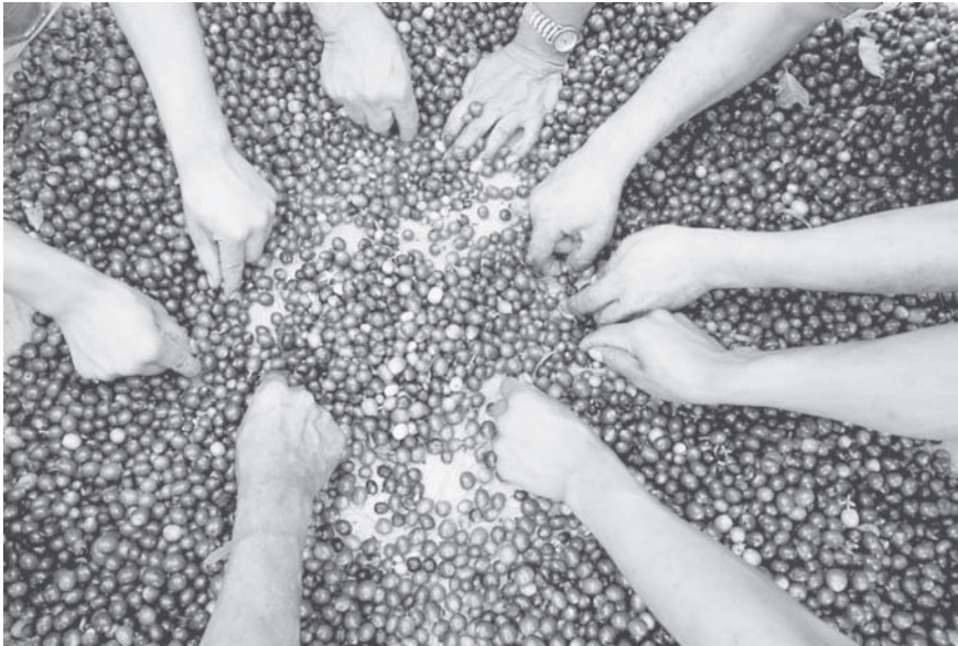
Sorting coffee beans.

Starbucks ice cream is not new; it has been around since 1996. Check out your local grocery store for the delectable Starbucks ice creams. Talk