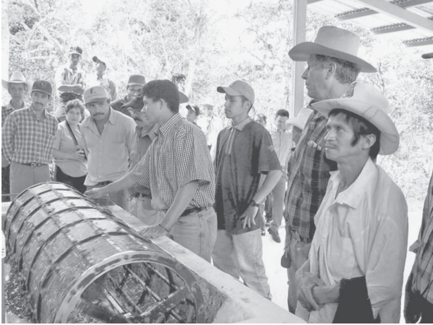
Nicaraguan coffee growers get fair trade status.

organic farming methods. Yet a total of four percent of Starbucks coffee purchases is Certified Organic Coffee.