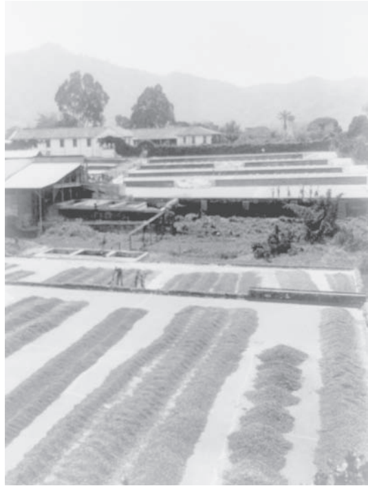
A Costa Rican coffee hacienda. The coffee beans are in a row drying in the sun. circa 1890–1923.

mind, scooping the beans from the fire to make a watery beverage with the powder. Hence, the first cup of coffee. The monk and his fellows drank the substance in order to stay awake during their all-night religious ceremonies.