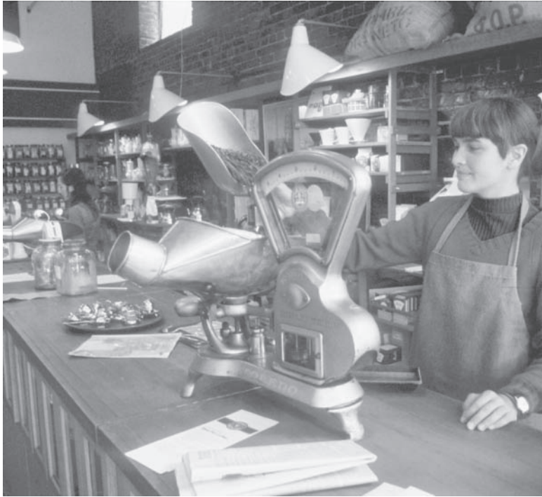
From 1977, a peek inside the Starbucks store in Seattle's Pike Place Market.

80,400 in early 1970 to 37,200 by October 1971. Many people, unable to find work in the area, were forced to move away. The situation was so extreme that two real estate agents, with a hint of humor, put up a billboard on the city's outskirts that read, "Will the last person leaving Seattle—turn out the lights?" However, Seattle did recover after the Boeing crash, and Starbucks coffee sales helped stimulate the local economic recovery.