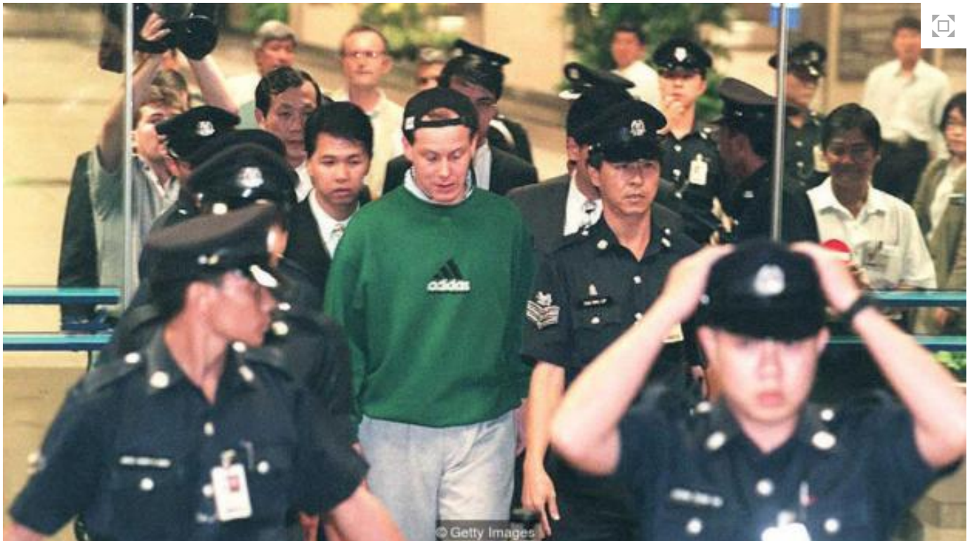
"Rogue trader" Nick Leeson brought down Barings Bank in 1995 with losses of £827 million

Like a gambler 'chasing losses' at a poker table, people stuck in the sunk cost trap will pretend that they have a winning hand. Nick Leeson, the infamous 'Rogue Trader' who caused the collapse of Barings Bank in 1995, followed similar reasoning in trying to recover his position from a series of disastrous early trades.