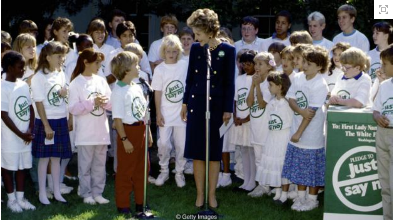
Former First Lady Nancy Reagan lead the 'Just Say No' campaign part of the Reagan administration's War on Drugs

Many examples bear out this trend on a global level. Public infrastructure projects are notorious for running over budget – Britain's proposed 'High Speed Rail 2' project – on course to overspend by £50 billion ($65bn) and counting, for instance.