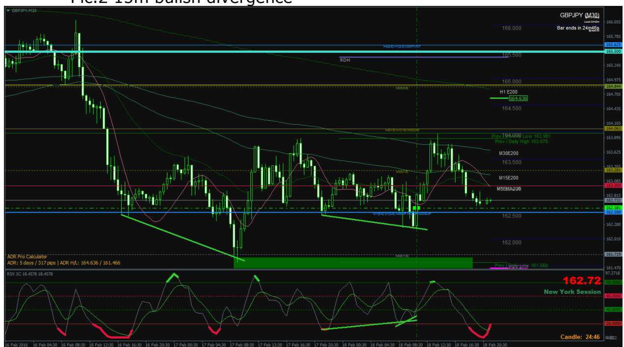
Pic.2 30m bullish divergence and even 1H