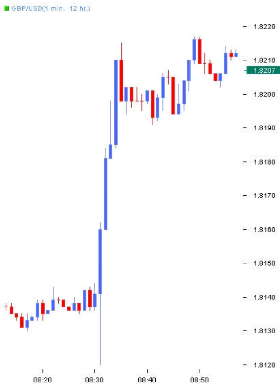
CHART 3 GBP/USD June 15, 2004 – 1 minute candles (time is EST)