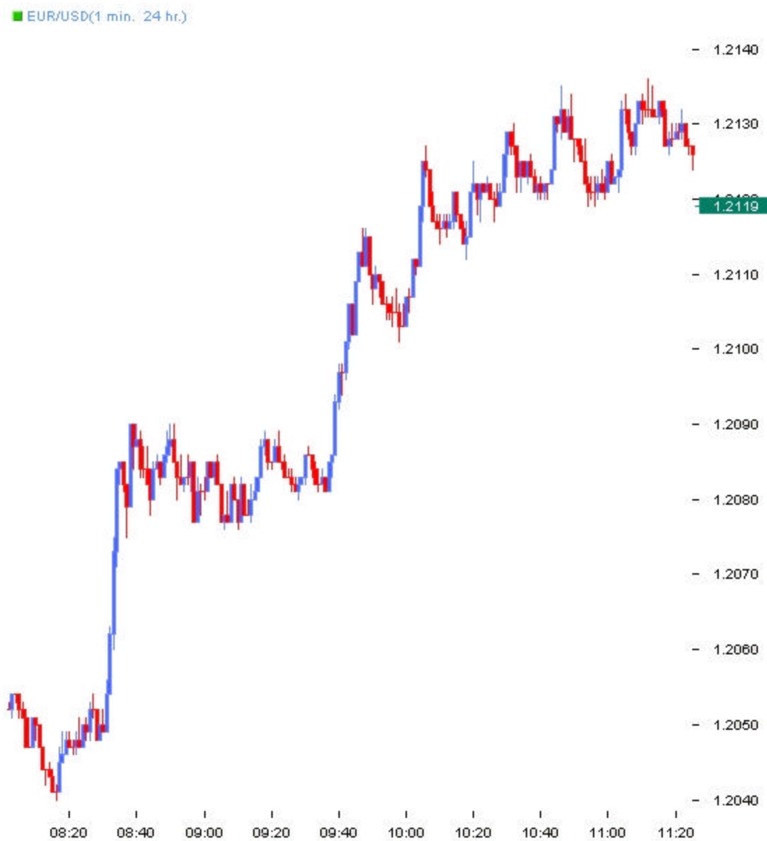
CHART 4 EUR/USD June 18, 2004 – 1 minute candles (time is EST)