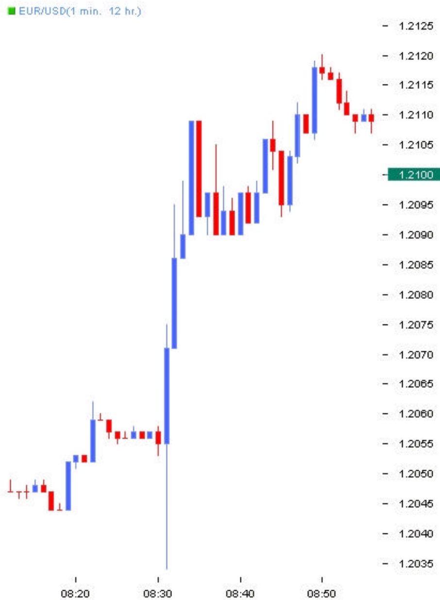
CHART 2 EUR/USD June 15, 2004 – 1 minute candles (time is EST)