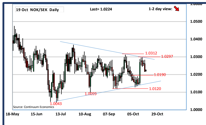
NOK, SEK Opening Updates